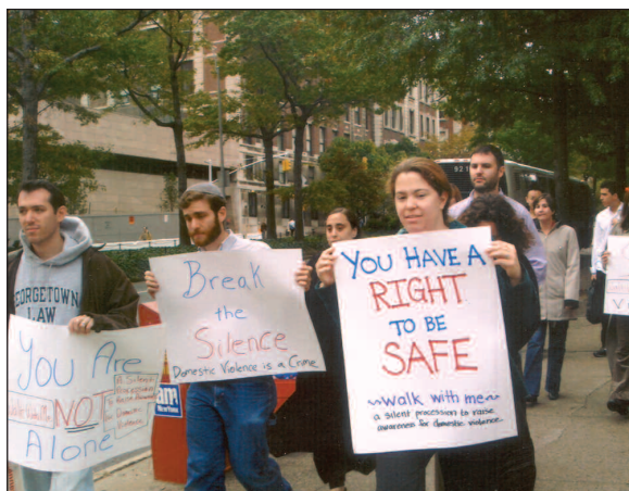
JTS students, staff, and faculty participate in Walk With Me: A Silent Procession to Raise Awareness for Domestic Violence.