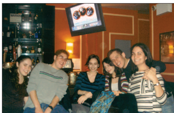
List College students at the annual Tzedakah Rocks! benefit concert.

The Rudin Center helped to ensure that the mitzvah of giving tzedakah remained a priority for JTS community members through its Annual Tzedakah Campaign, which included a variety of educational programs and events throughout the year. In addition, tzedakah boxes were strategically placed in the Dining Hall, residence halls, The Library, and in the JTS synagogues. This year's tzedakah campaign raised over $20,000 for organizations in need in the United States, Israel, and internationally.