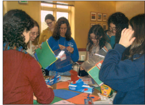
List College students at the Links to Leadership retreat make art kits for children who are patients at St. Lukes-Roosevelt Hospital Center

As students, faculty, and staff arrived at these annual Shabbat retreats, they assembled special art kits for children who are patients at St. Lukes Roosevelt Hospital.